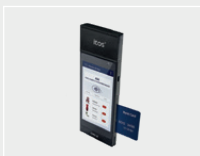
CM5-X/ UHF reader