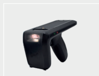
IRF-50 Long-range UHF RFID reader