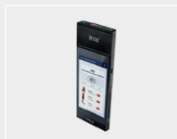
CM5-X/ UHF/1D-2D readers