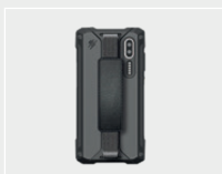
TPU protection case