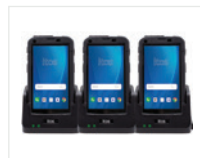
Multiple Charging Cradle